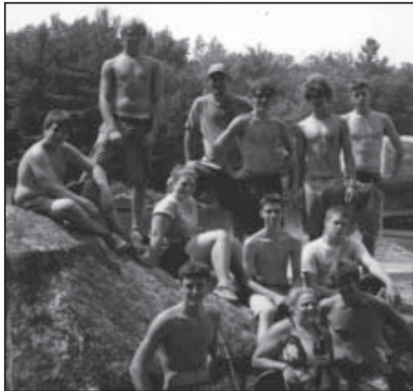
The Belgrade Lakes Conservation Corps is gearing up for another summer of erosion control projects in the watershed. High school students age 16 or older who are interested in joining a work crew should contact the BRCA office.