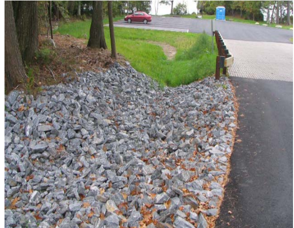
New Hosta Lane boat ramp showing rock-lined and vegetated swales along roadway and ramp with porous pavers.

By Pete Kallin, PhD, PWS, and Maggie Shannon