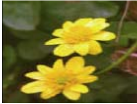
Marsh Marigold ( Caltha palustris ) for a Sunny Rain Garden