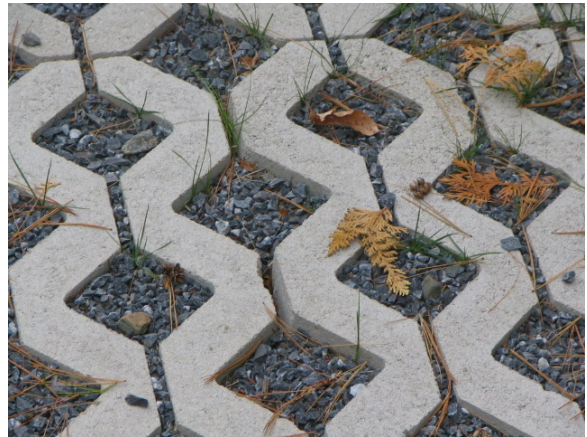
Close-up of porous pavers.